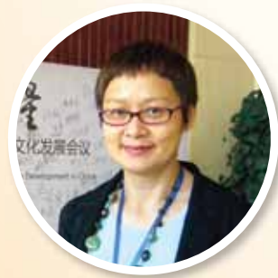
Percie Wong 王素瑩

楊佩玲為專業培訓師，作家及故事人。在舊金山州立大學畢業，取得英國文學學士及工商管理碩士。曾為香港兩大雇主香港上海滙豐銀行和香港政府服務超過十年。於2001年開設顧問公司。經常往返美國、香港和中國大陸，為跨國公司及非牟利機構度身設計培訓工作坊。她獲美國國際演講協會頒予最高榮譽 DTM (Distinguished Toastmaster)，亦是加州 Southbay Storyteller 的資深會員和故事導師，為超過50所學校、圖書館、書店、社區中心，舉辦訓練及工作坊以推廣閱讀。她的著作有2004出版的兒童圖書【襪子天堂】。